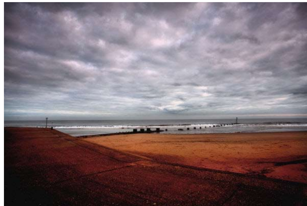
PETER HATTER Mablethorpe Winter Beach Level 3 Wards