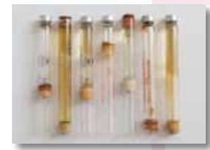
SIMON CARTER INTERIOR AND GLASS VIALS Level 2 Outside ICU