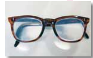
TEZ MARSDEN DERBYSHIRE LANDSCAPES AND NHS GLASSES Level 4 outside Medical Wards