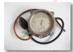
DERBY MUSEUM AND ART GALLERY MOONS AND OSCILLOMETER Level 3 outside Medical Wards 307-312