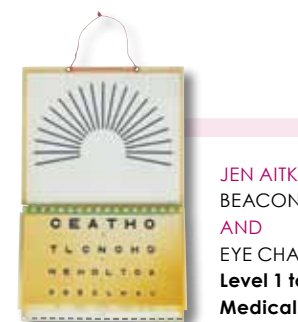
JEN AITKEN BEACON AND EYE CHART Level 1 towards Medical Outpatients