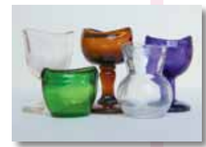
SUE KING SCULPTURAL GLASS AND GLASS EYE BATHS Level 2 outside Surgical Wards