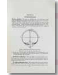
DERBY MUSEUM AND ART GALLERY ATLAS COELESTIS AND VISUAL OPTICS AND SIGHT TESTING BOOK Level 2 KTC