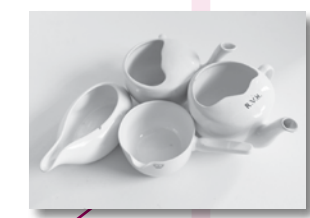
JODIE MASTERS HOME AND CERAMIC TEA SET Level 3 outside Medical Wards 309-310